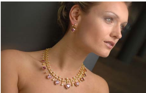
4. Neck chain - light weight gold with pink sapphire