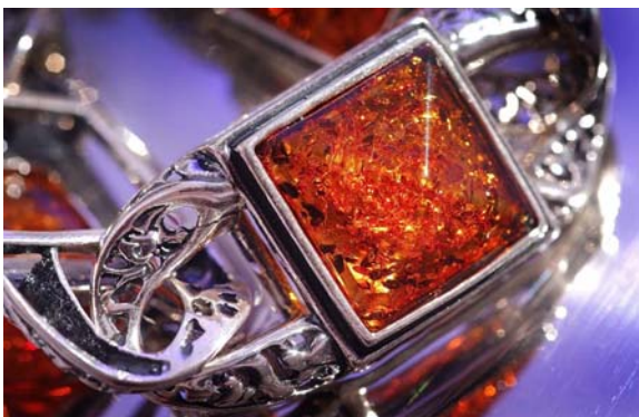
8. Bracelet – decorated silver with Polish amber