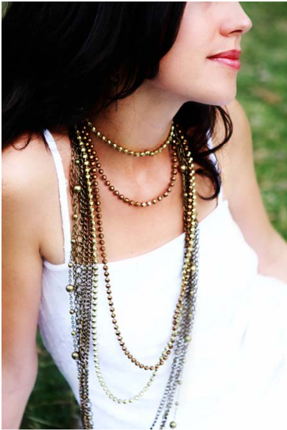
1. Long necklaces - coloured pearls and chains