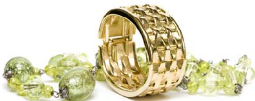
5. Bracelet - open structure with beaded neckwear