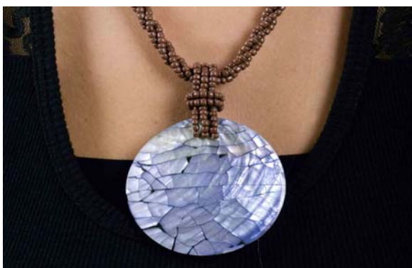
7. Large pendant – enamel on beaded lace