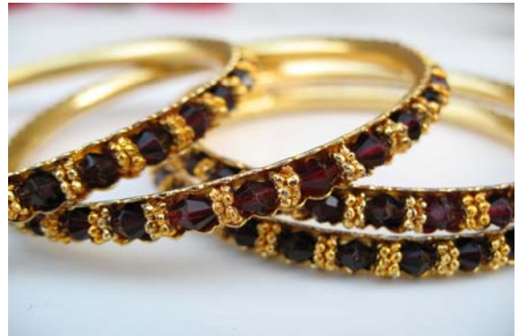
2. Bangles - fine gold with dark garnets