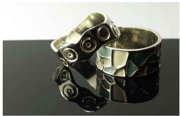
3. Rings - silver of special design with enamel