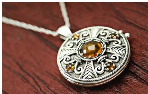
10. Pendant – Celtic silver with dark citrine