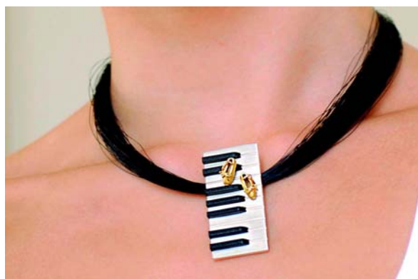
12. Neckwear – reflecting personality