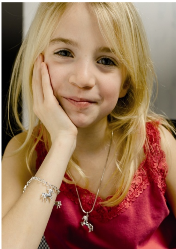
11. Children's jewellery – with charms (horses)